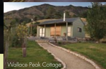
Wallace Peak Cottage